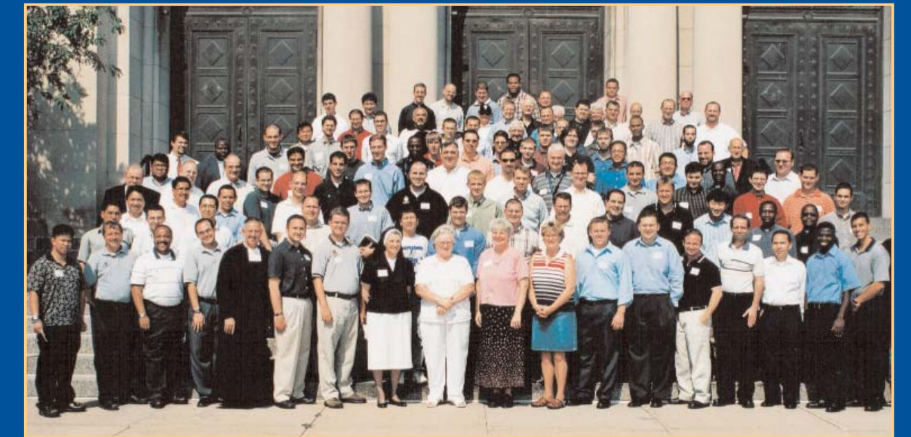
IPF seminarians, staff and Serrans gather at St. Cecilia Cathedral, Omaha, NE