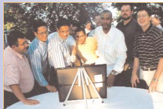
A group of seminarians admire the display table